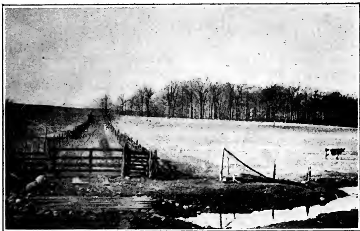
Sacred Grove, and lane from the barn, showing grove in the distance; also the creek where some of the early baptisms were performed, Palmyra, New York.